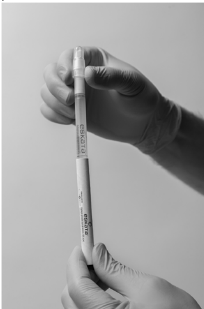
Step 3: Remove the sleeve.