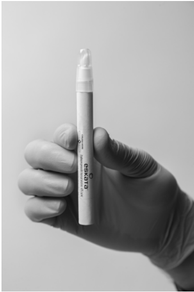
Step 1: Hold the ESKATA applicator so that the applicator cap is pointing up