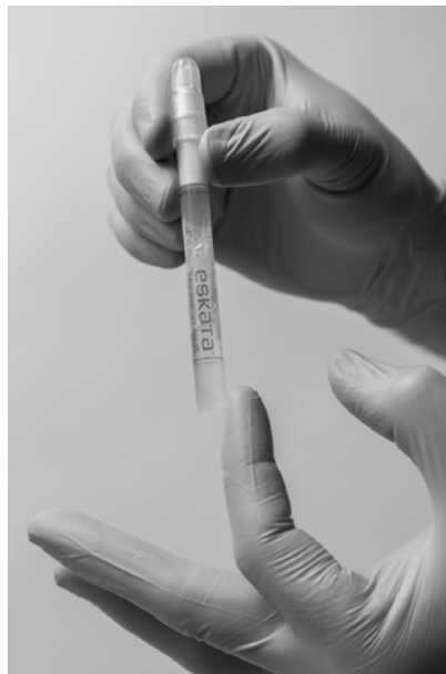
Step 4: Holding the applicator with cap pointing up, tap the bottom of the applicator to separate the solution from the crushed ampule.